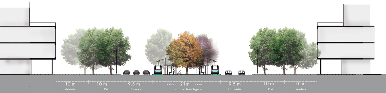
Perfil vial 1 Esc 1:500