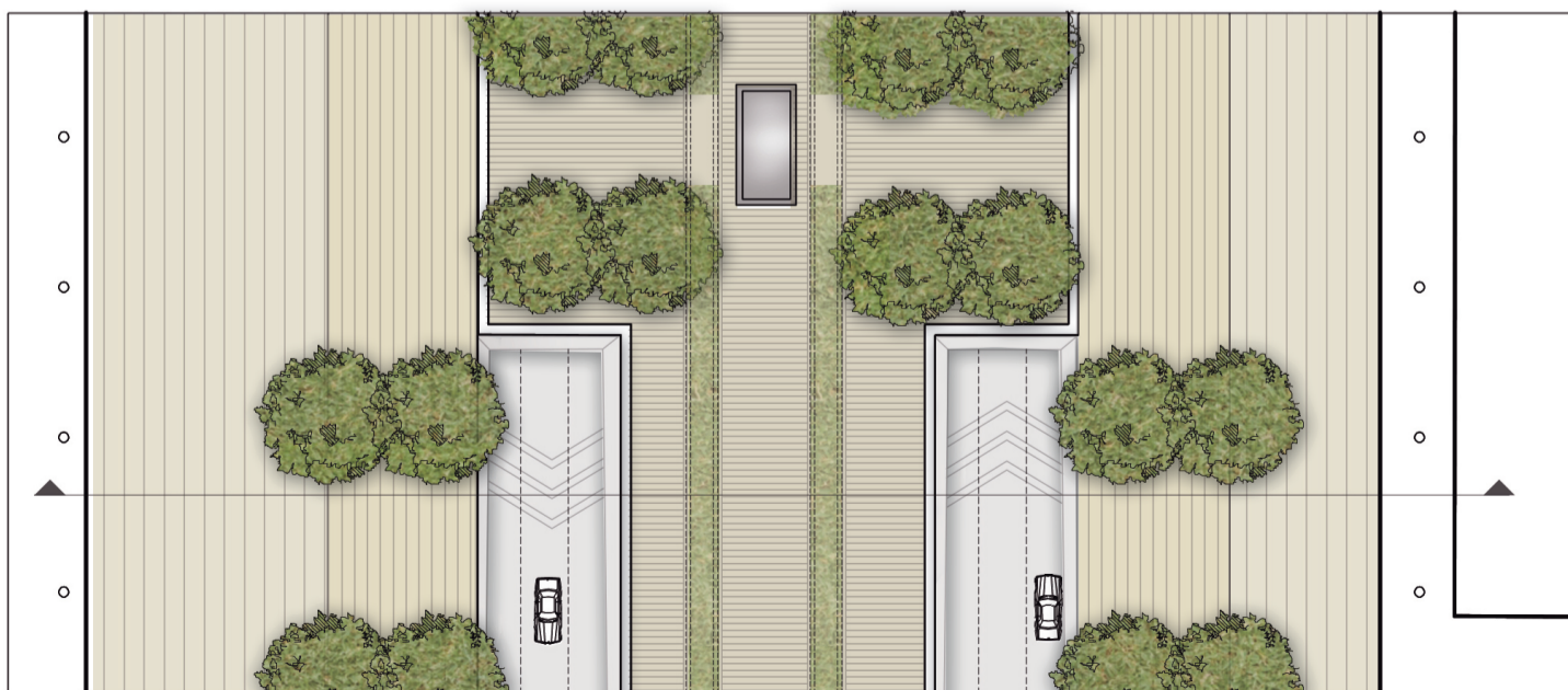
Planta via Esc 1:500